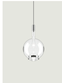
Sky-Fall Round medium